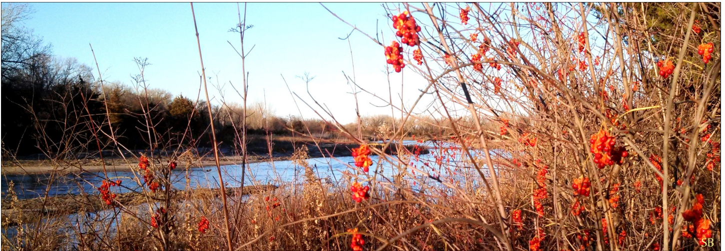
Platte River & bittersweet along Griffith Prairie north border.

It's already time for the Year in Review! Here's a summary of 2013: