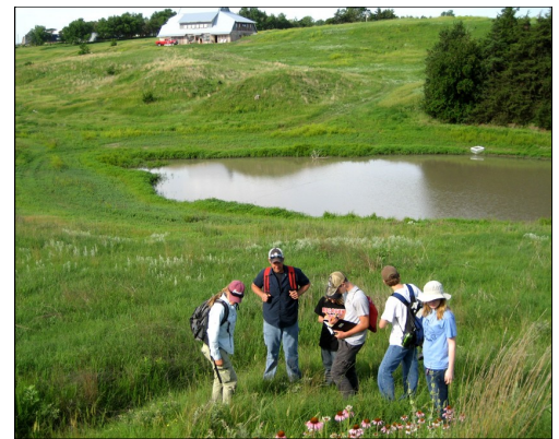
The Youth Naturalist Program made its debut in 2013, offering SOAR camper alumni and other older students the opportunity to learn about local native ecosystems.