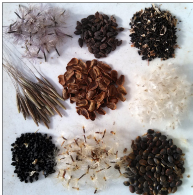
Amazing seed diversity - working with over 70 species in the greenhouse now.

The Fall 2013 combine harvest was significantly improved by the addition of another grain cart, a combine trailer, and additional drying equipment (seed must be dried before being mixed and stored). Modifications to the grain carts and drying equipment (tubes & fans) made it possible to dry seed in the carts, vastly improving processing efficiency. In the past, seed was handled multiple times – from combine to hand-made boxes on trailers, to