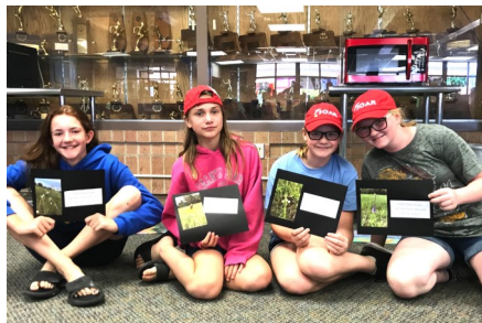
Photos & Odes