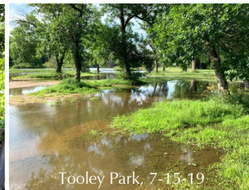
Tooley Park, 7-15-19