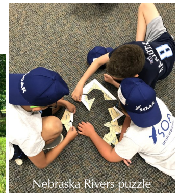
Nebraska Rivers puzzle