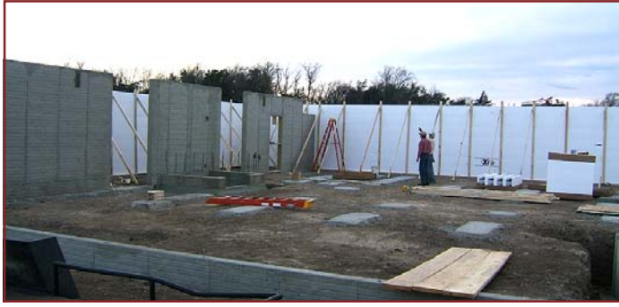
Taking shape : ICF forms in place for the south and west foundation walls.