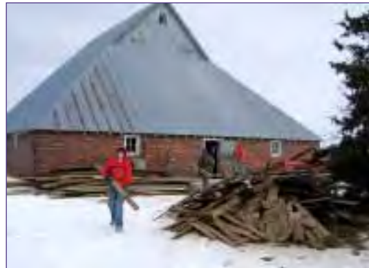
Sands Barn interior tear-down/cleanup day - January 27