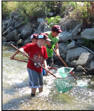
With such low flow in the Platte, our Fish Find was a bit too easy. Netting in deeper pools along the riverbank brought up large catfish and carp struggling to survive.