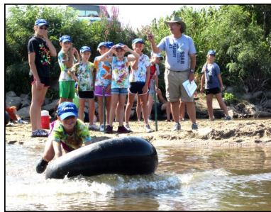
The shortage of water didn't allow for tube racing, but we managed to incorporate some tube work in the obstacle course!