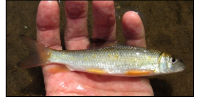
More great River Day finds, from top: spiny softshell turtle; red shiner in breeding colors; shorthorn redhorse (a first for SOAR). All catches are released after everyone has a chance to see them.