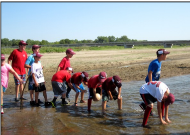
There was just enough water to allow for two of our favorite lively River Day games - River Ball and Raccoons R Us.