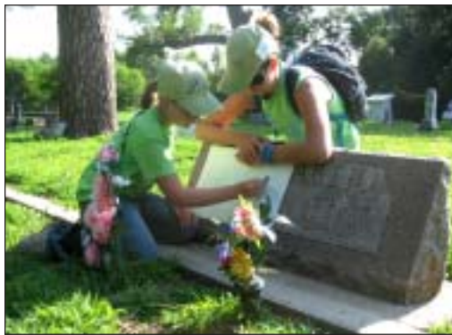
We made rubbings from some of the stones; later in the afternoon we did some writing to go with the rubbings.