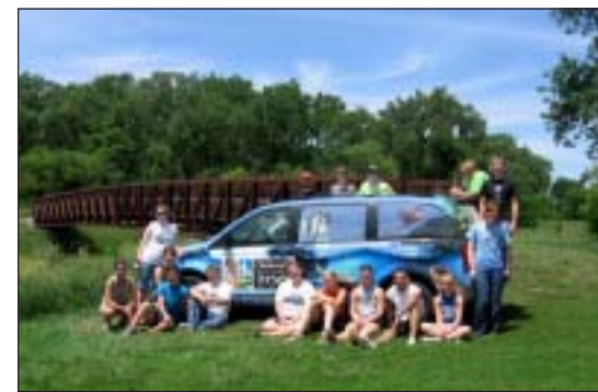
The Summer Research team with the Henry Doorly Zoo-mobile. The amphibian research was done in collaboration with the Omaha zoo.