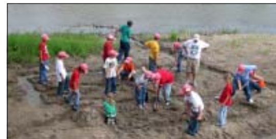
This red hat group is attempting to sculpt out Nebraska and her rivers.