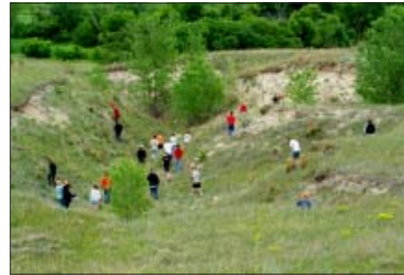
Enrichment students searching for critters in one of the seven ONP ecosystems - the sandhill prairie.

The Summer Enrichment program is made possible by the Albion Education Foundation and Boone Central Schools.