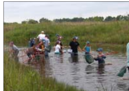
It isn't SOAR without "Wet & Wild!" This session was held in a backwater area of Rowe Sanctuary.

Big Bend SOAR publishes an annual "SOAR Journal," which, besides more details of the program, includes acknowledgements of financial supporters. To request a copy: rjhultquist@gtmc.net . See more photos at rowesanctuary.org - also on Rowe's Facebook page (just google Rowe Sanctuary Facebook).