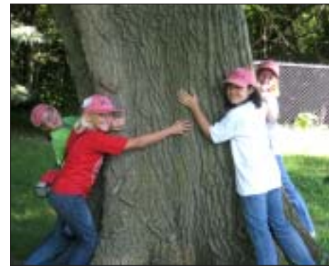
Yes, we love the trees...but these campers were also measuring the circumference of the trunk.