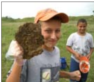
THURSDAYS were spent at Griffith Prairie and the Platte. "Prairie Pie" was a history and ecology lesson that ended with a wild flop-flingin' contest.