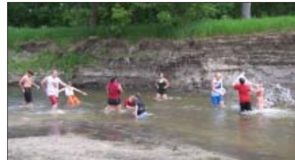
Good old fashioned outdoor play - frolicking in the river and fashioning sand sculptures - enriches body, mind and spirit!