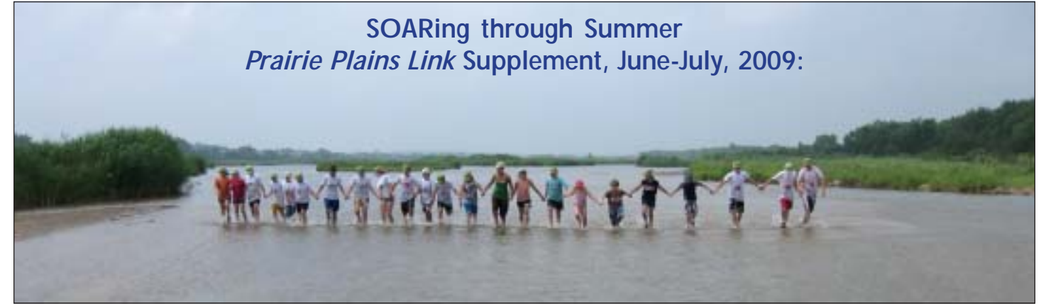
The SOAR (Aurora Camp) green hat group herding fish on River Day, July 10.