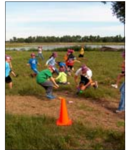
"OK Corral" was a great Plan B activity for River Day, which was played beside - rather than in - the Platte. The pistols were loaded . . . with water.